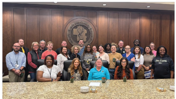
The Moultrie Office & Headquarters was a stop on the Local Teacher Immersion Tour for Colquitt County School Teachers. Teachers learned about our partnerships with local schools, such as scholarships, class presentations, Washington Youth Tour and the Bright Ideas Grant for Teachers.