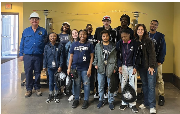
The Tifton Office recently hosted a group of Tift County High School special needs students, giving them a tour and educating them about energy and our cooperative.